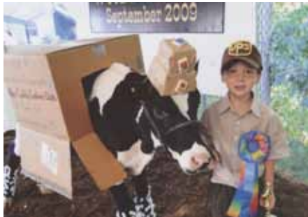
Woodstock Fair

Cannon Grange Agricultural Fair P.O. Box 23 Wilton, Connecticut 06897-0023 203.762.1900 cannon.grange@yahoo.com