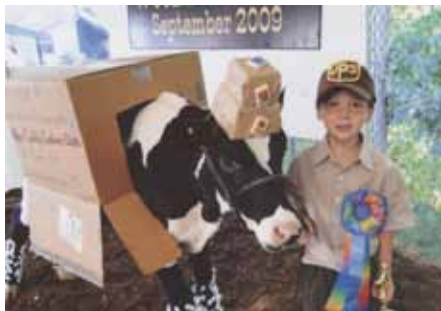
Woodstock Fair

Cannon Grange Agricultural Fair P.O. Box 23 Wilton, Connecticut 06897-0023 203.762.1900 cannon.grange@yahoo.com