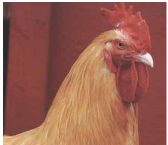
Brooklyn Fair