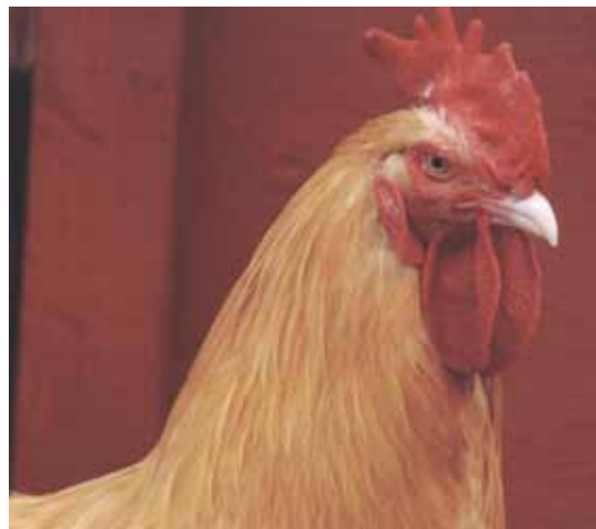
Brooklyn Fair